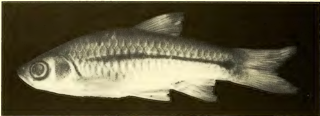
Fig. 2. Rasbora dorsinotata Kottelat, spec. nov. ZSM 26627, holotype, 41.7 mm SL.

Diagnosis: A new species of Rasbora distinguished by the combination of the following characters: dorsal fin with a black tip; a black lateral stripe from opercle to posterior half of caudal peduncle, ending in a rounded spot not extending on caudal peduncle scales; 26+1–2 scales on lateral line; 4½ scales between lateral line and basis of dorsal fin, 7 between lateral line over the back on caudal peduncle.